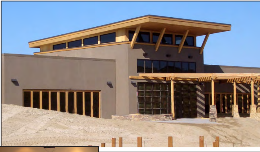
BLEYHL FARM & CONVENIENCE STORE - Grandview, WA PM - Mike Ross | Site Supervisor - Travis Glenn

Mountain States constructed a new farm supply and convenience store facility for Bleyhl Farm Service in Grandview. The pre-engineered steel building facility is 33,750 sf with a 16' x 35' receiving annex. The north and east side of the building have exposed aggregate panels to match the existing office facility previously constructed by Mountain States. The building also has a covered entry and walkway.